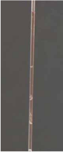
Figure 2. The Lancefield test. Positive reaction.